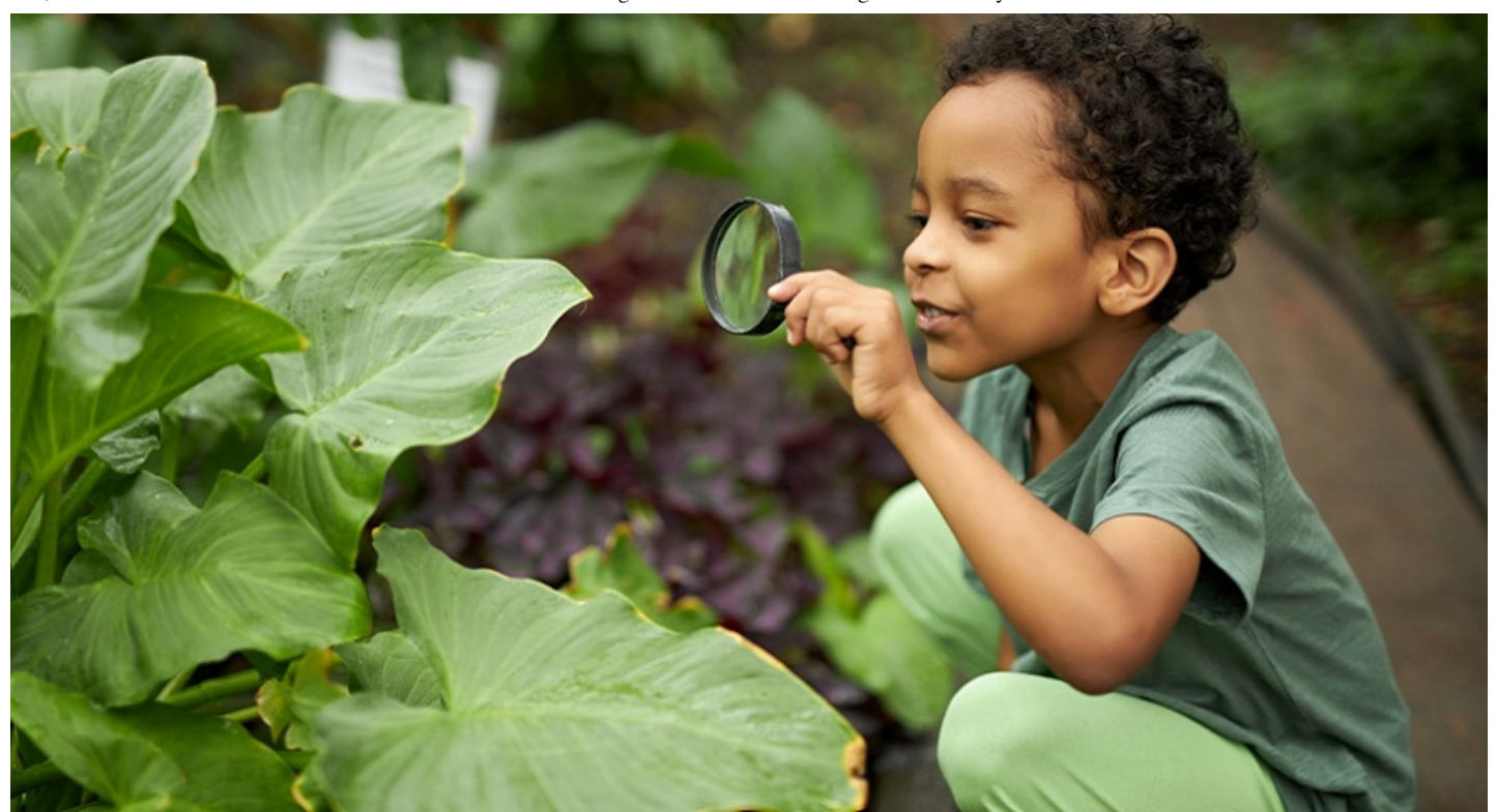
Go-To Nature Books About Bugs, Birds, and Animals, Too! (https://www.pasadenanow.com/pasadenaschools/go-to-nature-books-about-bugs-birds-and-animals-too/)