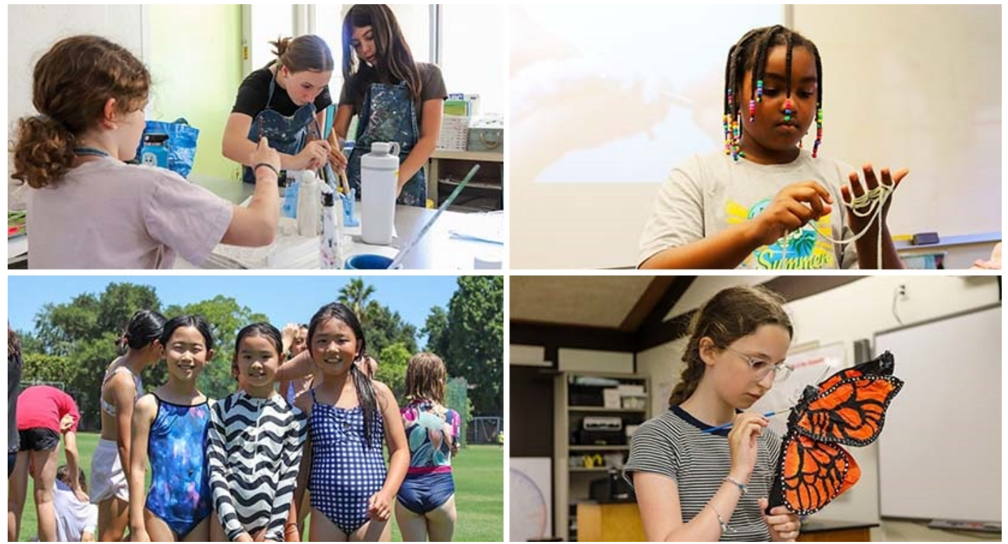
Westridge School Wraps Up 2023 Summer Programming (https://www.pasadenanow.com/pasadenaschools/westridge-school-wraps-up-2023-summer-programming/)