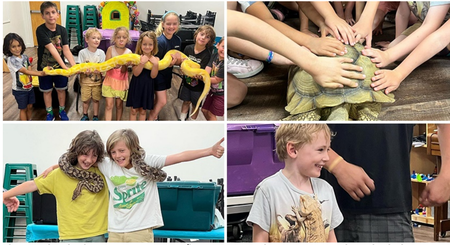
The Waverly School Summer Camp is Fun! (https://www.pasadenanow.com/pasadenaschools/the-waverly-school-summer-camp-is-fun/)